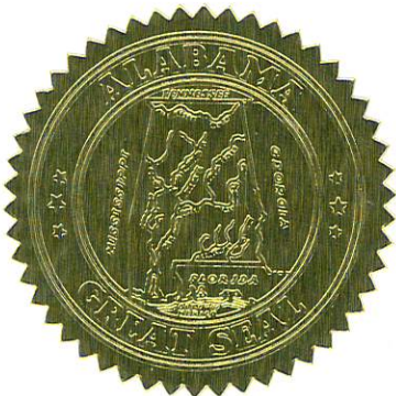
John H. Merrill Secretary of State